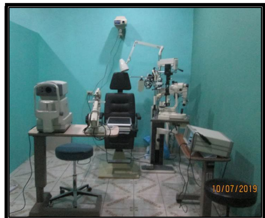
the eye examination room at the Eye Clinic in Trinidad