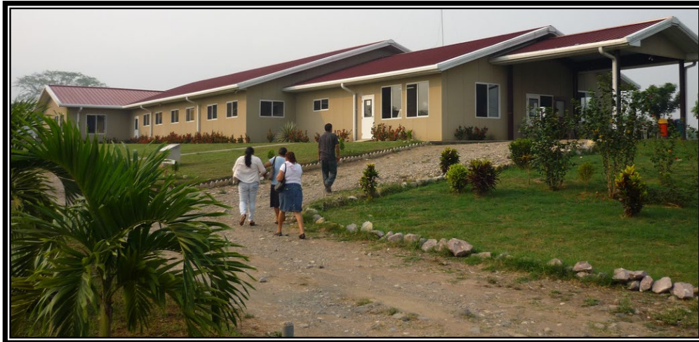
the Manos Amigas Clinic on the highway just outside the town of La Entrada

[we do not have the machine used for cataract surgery]