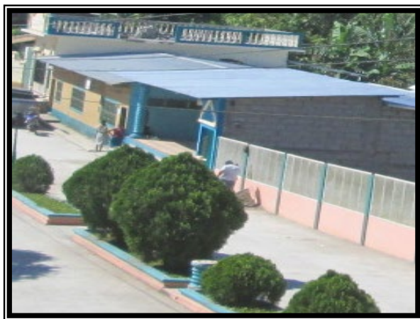
The government medical clinic is the yellow building on the street.

We will contact donors to “New Vision in Honduras” and advise them of the limitations / changes that require forming this partnership. We will also encourage them to continue to support this mission by giving through Serving at the Crossroads, a 501C3 organization. Information about this process will be shared with donors and the presbytery at large. We will ask SATC to note that donations from within the area of Providence Presbytery be designated for fees related to examinations and cataract surgeries for residents of the Municipality of Trinidad so that our original plan may continue.