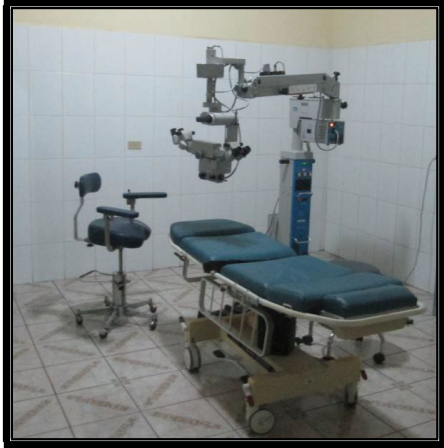
what was planned as the room for cataract surgery

[we do not have the machine used for cataract surgery]