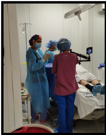
eye surgery at MA October, 2022